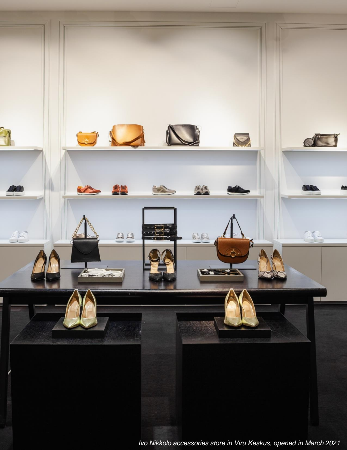
Ivo Nikkolo accessories store in Viru Keskus, opened in March 2021