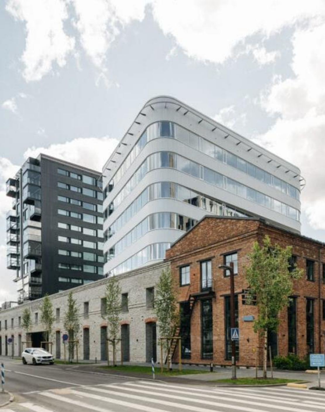
Lurich building.